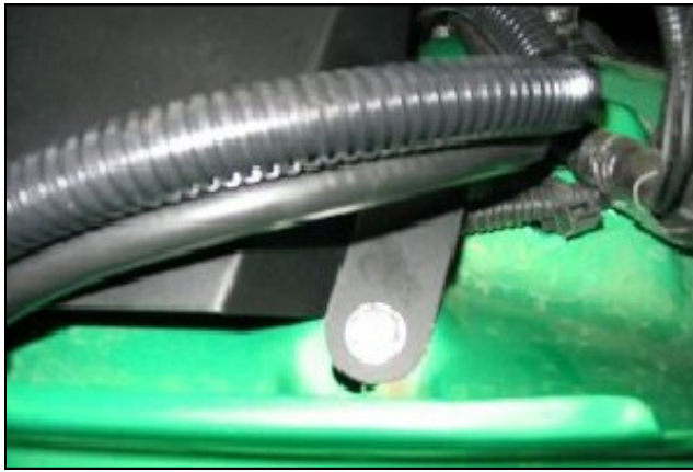
11. Using the supplied hardware and 7/16" socket, fasten the front of the Airaid Cool Air Dam to the fender.