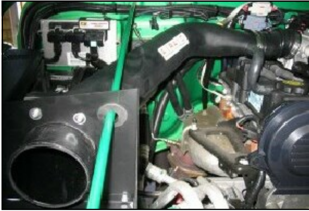
13. Install factory throttle body coupler on end of Airaid intake tube and position assembly on engine as shown. Mount Airaid intake tube to Cool Air Dam using two supplied 1/4"-20 bolts and washers provided. Connect factory breather hose to Airaid intake tube.