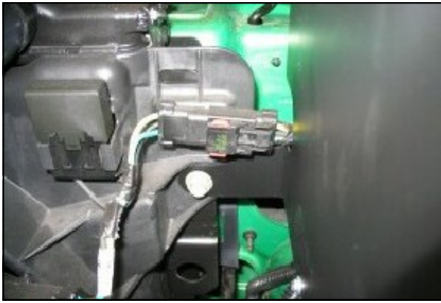
10. Using a 7/16" socket, reinstall the original bolt through the Airaid Cool Air Dam and radiator fan cover.