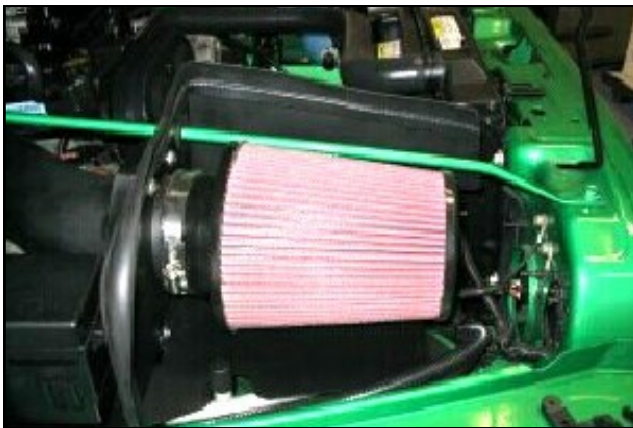
14. Install the Airaid filter on the end of the intake tube. Install the weather strip on the top edge of the Cool Air Dam. (Note: Start at one end and work your way around to insure proper alignment.)