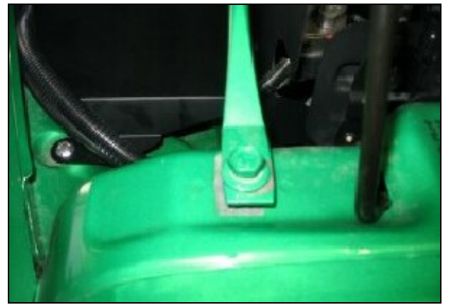
12. Using a 1/2" socket, reinstall the original bolt on the radiator support rod.